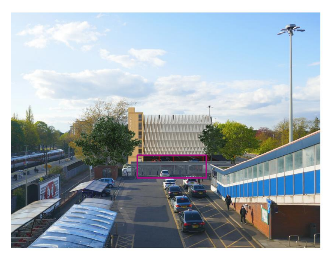
Figure 2. Visual from the station - South façade

The facility is managed and maintained by the provider, who provide and install Cycle Hubs.